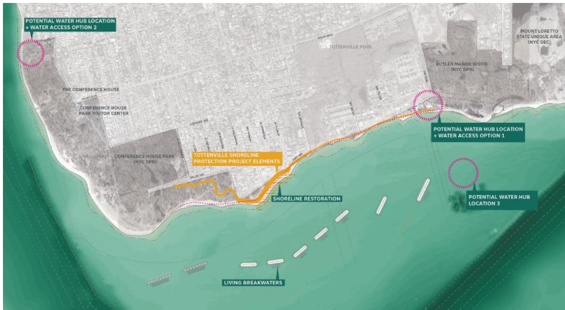
Figure 5 – Living Breakwaters at Preliminary 60% Design