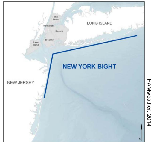
Figure 4: Map of Staten Island And New York Bight

Living Breakwaters: Tottenville Pilot (Living Breakwaters) is an innovative coastal green infrastructure project that aims to increase physical, ecological, and social resilience. The project is located in the waters of Raritan Bay (Lower New York Harbor), along the shoreline of Tottenville and Conference House Park, from Wards Point in the Southwest to Butler Manor Woods in the Northeast. The project area is a shallow estuary that has historically supported commercial fisheries and shell fisheries. This project also fulfills New York City's Resilience Plan Coastal Protection Initiative 15 i .