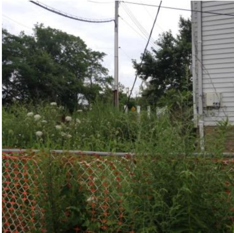
6 Front Date Taken: 7/20/2014