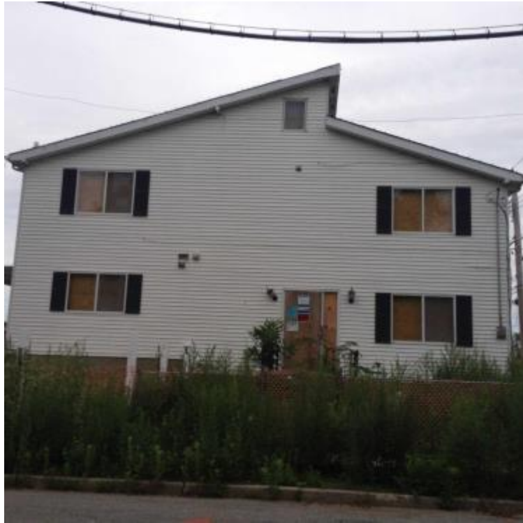
2 Signage Date Taken: 7/20/2014