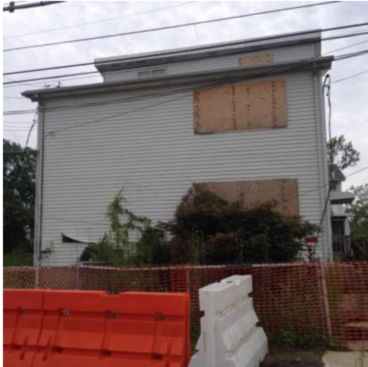
8 Right Date Taken: 7/20/2014